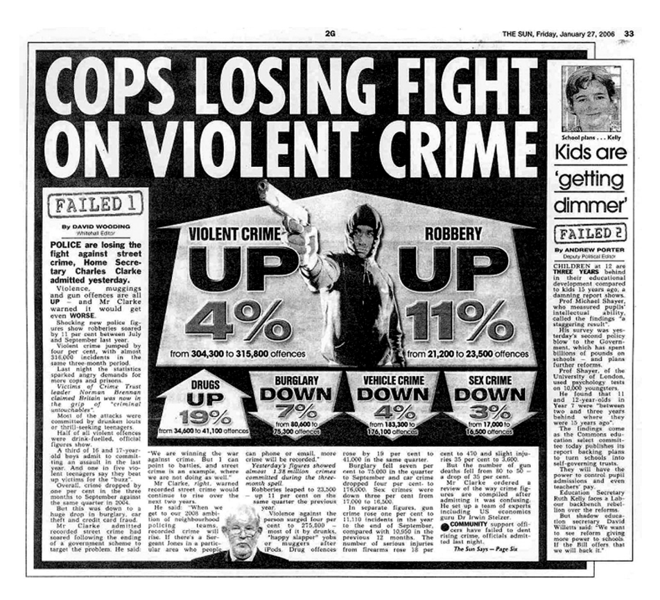
Figure 2.2 Cops Losing Fight on Violent Crime, Sun, page 33, 27 January 2006

▶ Signal crimes A term coined by Martin Innes which refers to those particularly serious or high profile crimes which impact not only on the immediate participants (victims, offenders, witnesses), but also on wider society, resulting in some reconfiguration of behaviours or beliefs (Innes, 2003).