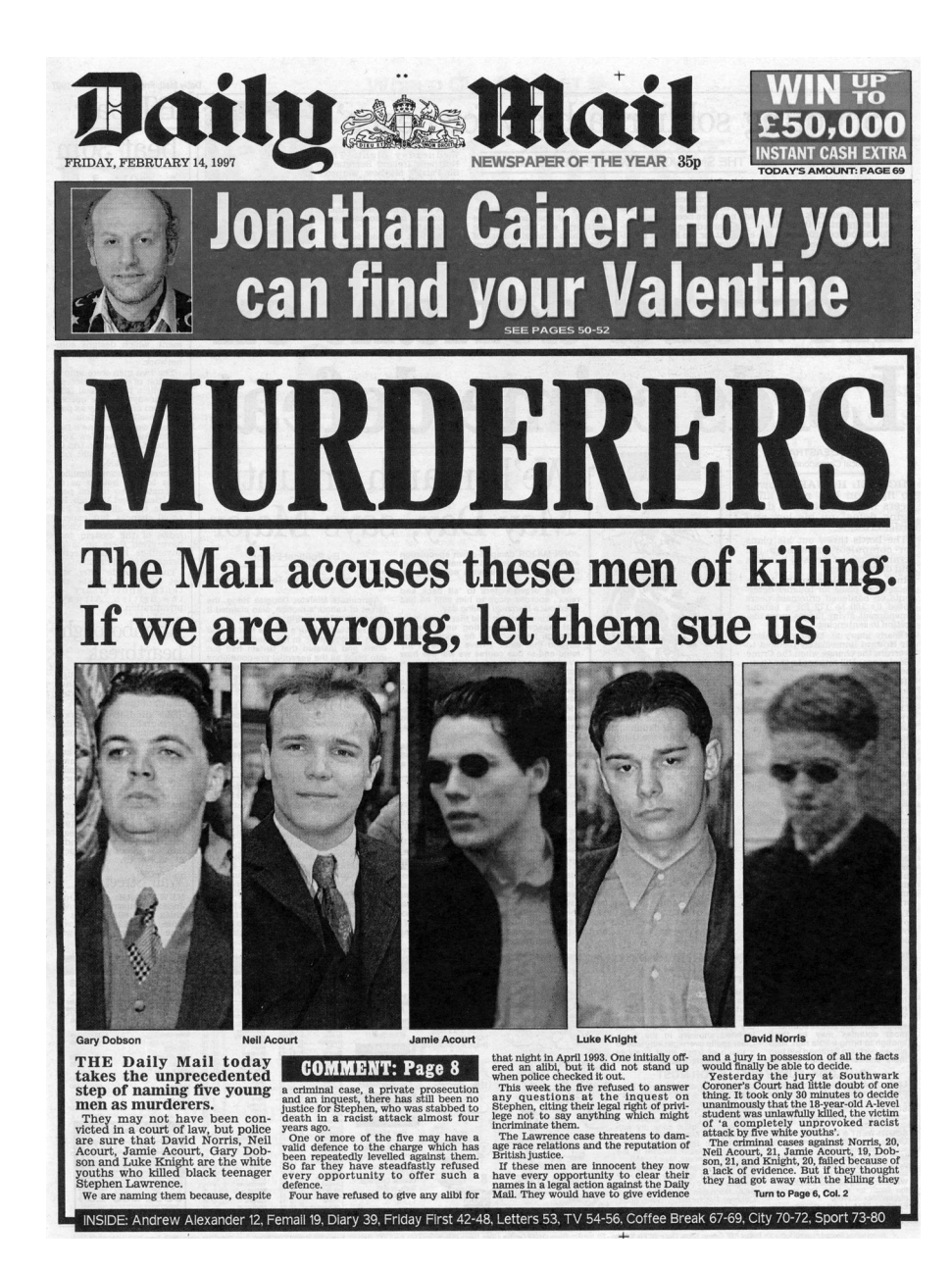
Figure 2.1 Daily Mail front page, 14 February 1997